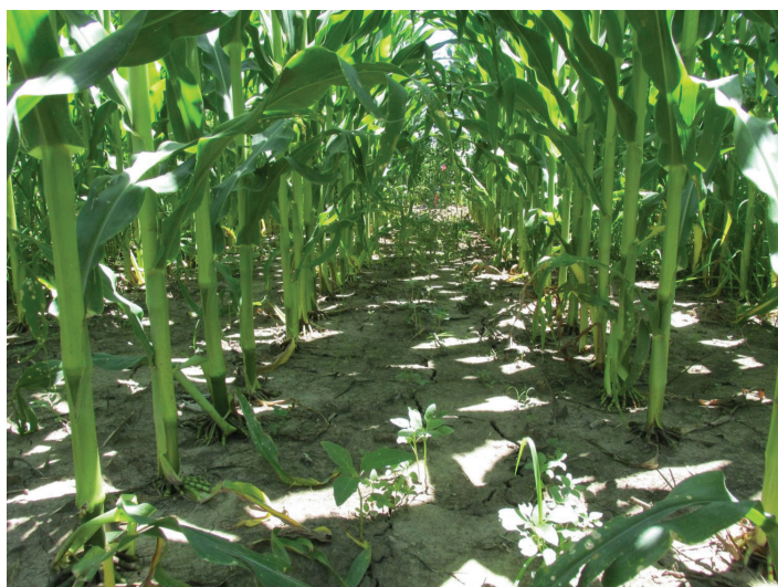
Lumax EZ 3.25 qt/A PRE