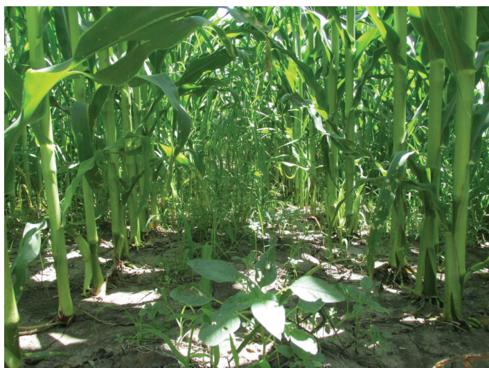
Resicore 3.0 qt/A PRE